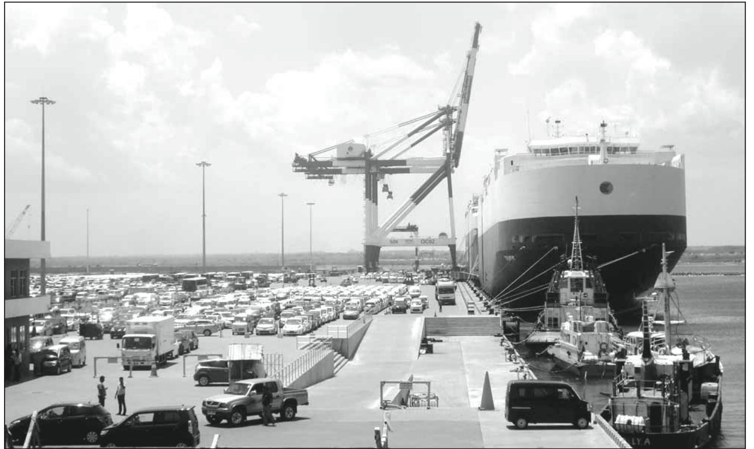
Hambantota Port, Sri Lanka.

For instance, the Quad, in the name of setting up a foreign aid group to jointly