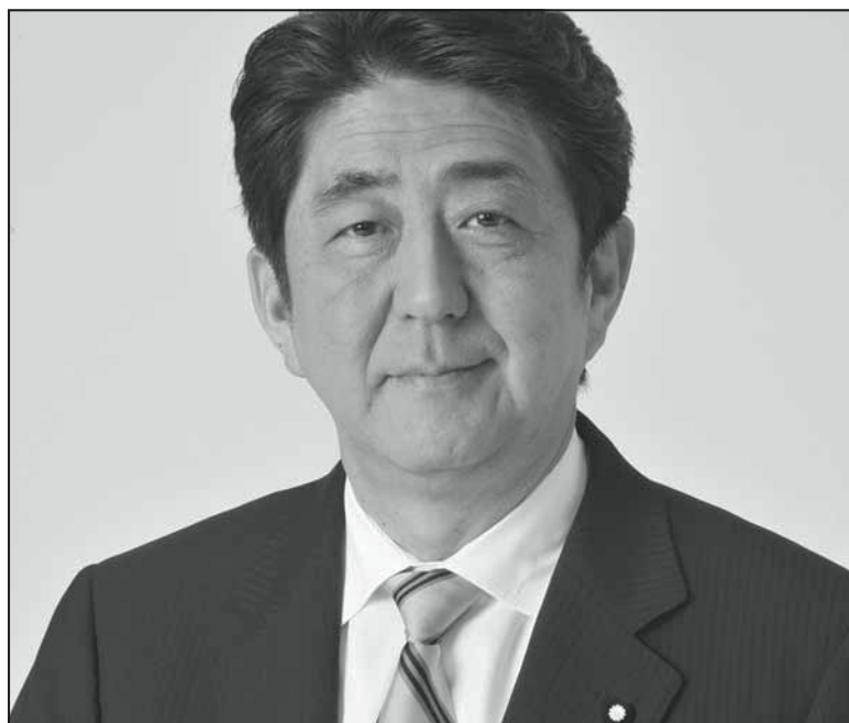
Shinzo Abe.

It states "the Japanese people forever renounce war as a sovereign right of the nation and the threat or use of force as means of settling international disputes." Further provisions limit Japan to only maintaining a limited