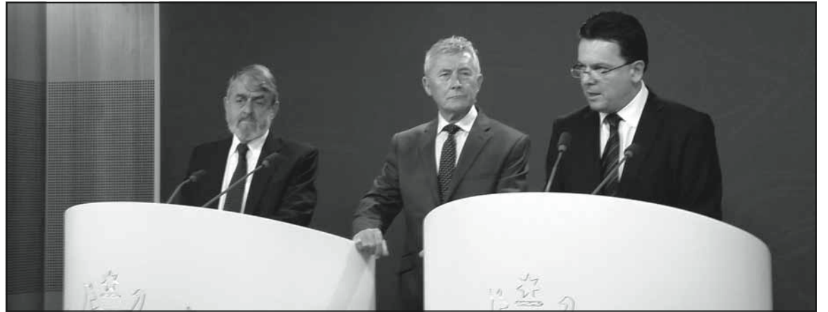
Senator Nick Xenophon with Bernard Collaery and Nicholas Cowdery QC in 2015 calling for a royal commission into the Australia-East Timor spying scandal.

As the Albanese government makes attempts to strengthen its relationship with Asia-Pacific partners in an attempt to counter perceived Chinese influence in Australia's imperial sphere of influence. The decision to drop the Collaery case works to shore up the