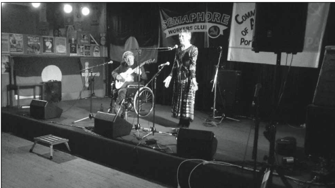
Tin Can Alley entertaining comrades at the Curry Night.

Through a close association with the Port Adelaide United Workers' Club, the CPA Port Adelaide branch has access to two fine venues for celebrations and Party activities. At the Semaphore Workers' Club – where a fine reputation of regular popular music has been established – there is a venue capable of catering for a hundred people or more with friendly bar facilities, and the welcoming possibility of combining delightful food, stimulating politics, and jovial camaraderie.